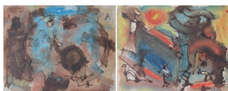
1190) 2 Merton Simpson Abstract Watercolors