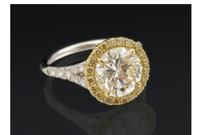
1035) 3.03 Ct Diamond w/ Fancy Yellow Diamond Halo in 18K