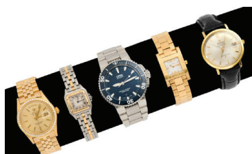
1053) Rolex 18K Diamond Bezel Presidential Watch, Pie Pan Dial; 1077) Lady's Cartier Panther Wristwatch; 1069) Oris Stainless Steel Automatic