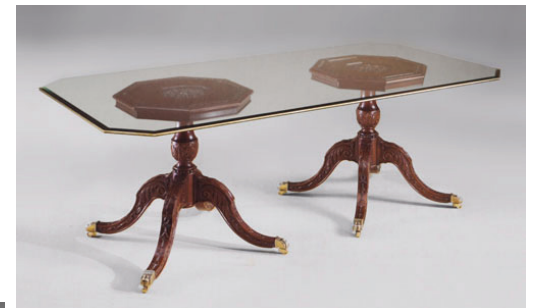
1024) Hickory Manufacturing Heirloom Collection Rococo Dining Table w/ Glass top, Model 1970-52p; 1025) 6 Hickory Dining Chairs (not shown)