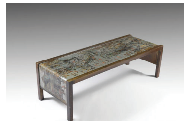
1004) Philip & Kelvin LaVerne Spring Festival Table, 53" long