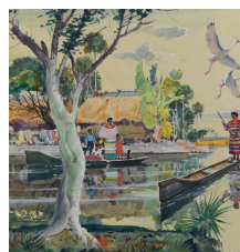
1216) Warren Baumgartner Watercolor Seminole Indian Village