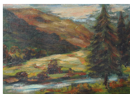
1150) Emily Carr Oil/Canvasboard Wilderness Landscape with Stream