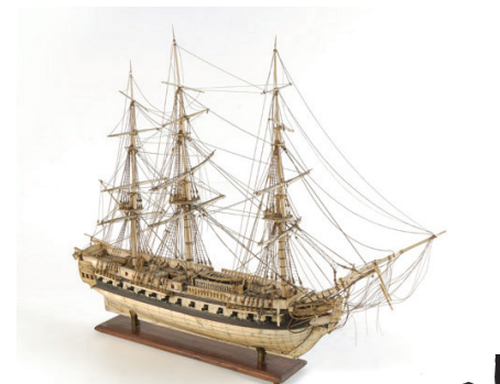
1065) Early 19th C Three-Masted Prisoner of War Bone Ship Model. 19" h x 23"