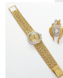
1029) 18K Gold Bueche Girod Wristwatch, quartz movement; 1030) 14K Gold & Diamond Brooch, 4.15 ct total