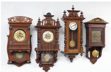
Collection of German wall clocks to include Furtwangler, Gustav Becker, Mauthe and more