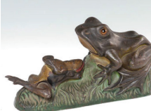
1022) J&E Stevens 2 Frogs Mechanical Bank, 4 1/2" h. x 9" x 3 1/4"