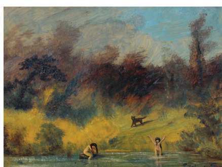
1195) Louis Elshemius Oil/Board Nude Bathers