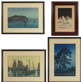
Hiroshi Yoshida, Kawase Hasui, and Koson Ohara