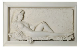
2 Large Bill Mack Bonded Sand Sculptures