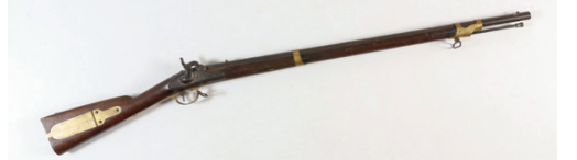
1211) US Percussion Model 1841 "Mississippi" Rifle