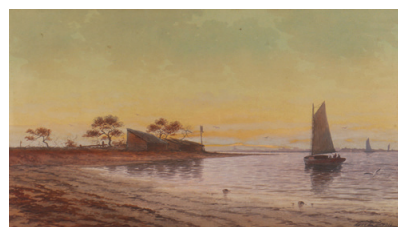
1225) Large George Essig Watercolor