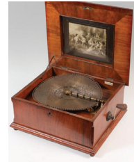
1008) Inlaid 15 3/4" Polyphon Music Box and Discs