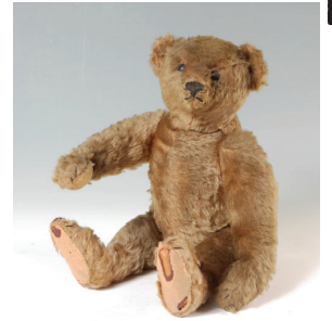
1009) 16" 1904/1905 Steiff Mohair Bear with blank iron button