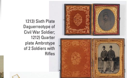
1213) Sixth Plate Daguerreotype of Civil War Soldier; 1212) Quarter plate Ambrotype of 2 Soldiers with Rifles