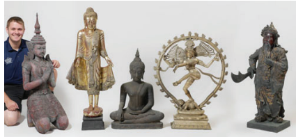
Oriental Carved Wood and Bronze Figures