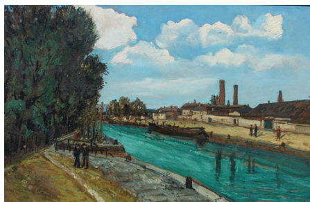
1040) Leon Quizet Oil/Coard Canal Scene