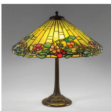
1012) Duffner & Kimberly Mandevilla Leaded Glass Table Lamp, 22 1/4" dia. Shade