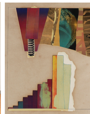
Robert Rauschenberg, "Horsefeathers Thirteen-VII, 1976" Offset Lithograph