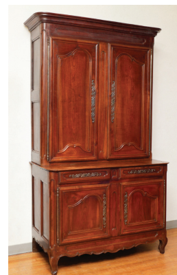
19th C French Buffet Deux Corps