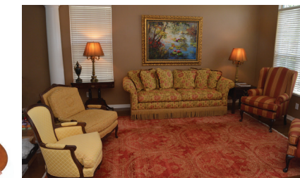
Contents of a Prestigious Carrolwood Estate