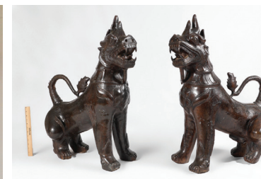
Pr Bronze Tibetan Temple Lions, 34" H