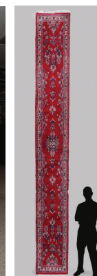
Exceptional Oriental Runner

Sunday's Auction Features Over 250 Authentic Modern Master Artworks!