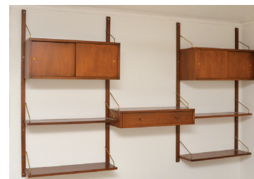
Mid-century Modular Wall System in the manner of Poul Cadovius

A "Virtual Museum of Treasure" and it can be yours!