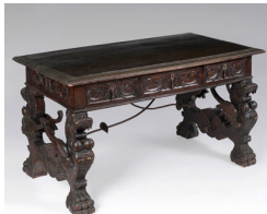
1022) Renaissance Revival Carved Griffin Library Table