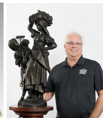
1029) Large Period Mathurin Moreau Bronze