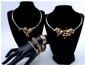
1241) Heavy 14K Dolphin Necklace "Go Dolphins"; 1242) 14K Manta Ray Motif Ladies Necklace "Go Rays"; 1122) 14K 3.00 CTW Diamond Tennis Bracelet; 1021) 14k Modern Slide Mesh; 1123) Heavy 14k Mesh/Link Bracelet