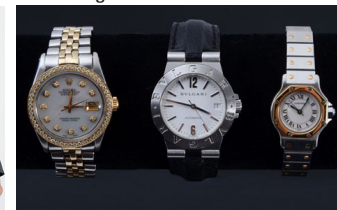
1223) 18k & Sterling Rolex Oyster Datejust; 1221) Bvlgari Diagono Sport LCV35S Leather Belt Auto Men's Watch; 1222) Ladies 18K & SS Cartier Santos Octagon Watch