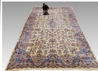
1036) Palatial Persian Kirman Carpet 14'7" x 24'9"