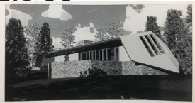
Original Blueprints for Frank Lloyd Wright Home with many signed letters. This is a photo of the home, which was never built, from Wright's catalog.