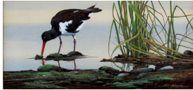
1229) One of 14 Neil Adamson paintings in the sale