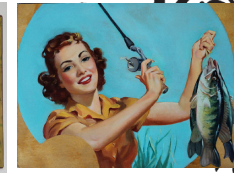
1275) One of Several Fay Prout (Davis) paintings in the sale