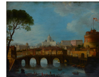
1020) Early Painting of Rome and the Tiber, Possibly Antonio Joli