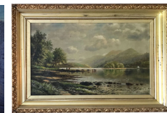
1193) Panoramic Edmund Darch Lewis Oil/Canvas Cows Crossing a River