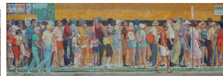
1199) One of a collection of many George Prout Paintings in the sale.