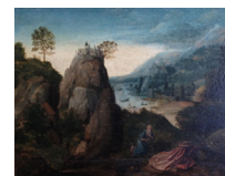
1028) Joachim Patinier "The Penitent St. Jerome" Oil/Panel