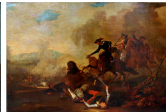
1015) Terrific Early Battle Scene in the manner of Rosa