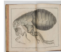
1005) Rare Volume of Denis Diderot's "Histoire Naturelle"