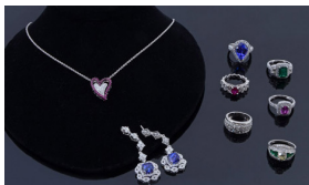
1093) Dali-Like Heart Pendant w/ Rubies, 18k w/ 18k Chain; 1141) Dazzling 14k Tanzanite & Diamond Dangle Earrings; 1142) Platinum 7.48ct Tanzanite & Diamond Ring; 1121) Classic 14k 2.15ct Diamond & Emerald Ring; 1171) 18k Ruby & Diamond Ring; 1131) Platinum No Heat Pink Sapphire & Diamond Ring; 1210) 1.50 Ctw Platinum & Diamond Ring; 1151) Platinum Emerald & Diamond Edwardian Revival Dome Ring.