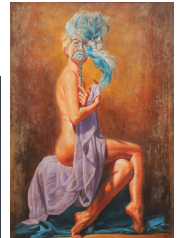
1055) Large Original Tomasz Rut Painting