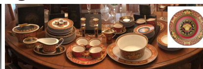
1116) Rosenthal Versace Medusa Porcelain Dinner Service for 8