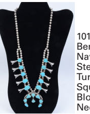
1011) Ray Bennet Navajo Sterling & Turquoise Squash Blossom Necklace