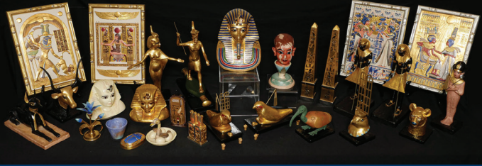
Fantastic 26 Pc Boehm Porcelain King Tut Collection