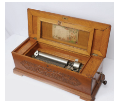
Mermod Freres Golden Oak Cylinder Music Box