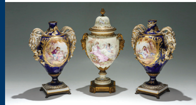
Sevres Porcelain Urns