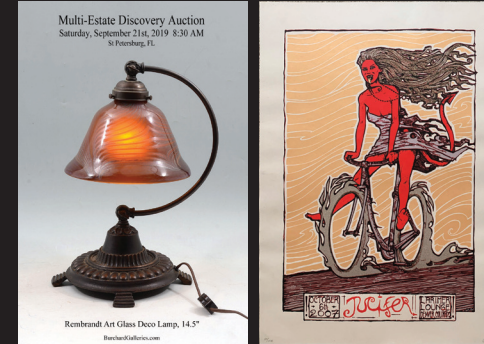
Multi-Estate Discovery Auction Saturday, September 21st, 2019 8:30 AM St Petersburg, FL