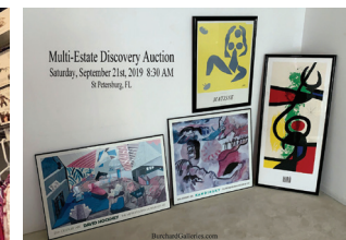
Multi-Estate Discovery Auction Saturday, September 21st, 2019 8:30 AM St Petersburg, FL