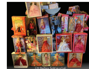
120 Barbies Sold as a Lot

*NOTE: More arriving! Only about 20% of what is available on Saturday is represented here. Please check the Web Site, better yet, come see us at the preview as well. Furniture & Art beginning at 8:30 AM. Art requests at any time. All other requests taken at 10:00 AM. ABSOLUTELY NO RESERVES!