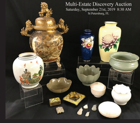
Multi-Estate Discovery Auction Saturday, September 21st, 2019 8:30 AM St Petersburg, FL