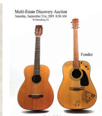
Multi-Estate Discovery Auction Saturday, September 21st, 2019 8:30 AM St Petersburg, FL