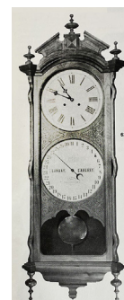
1042) Double Dial Ithaca Wall Calendar Clock Number 2 Bank Model