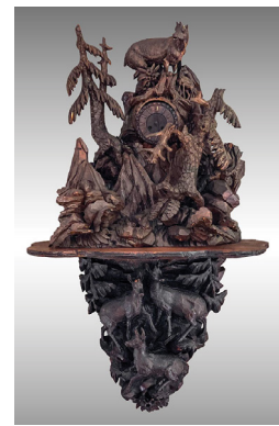
1106) Most Impressive Black Forest Carved Walnut Clock