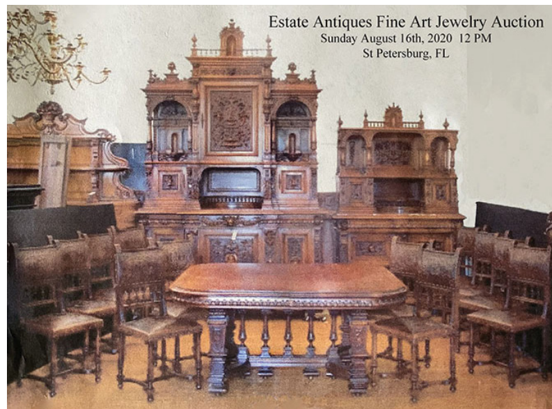
Massive Carved European Breton Dining Room Furnishings

Estate Antiques Fine Art Jewelry Auction Sunday August 16th, 2020 12 PM St Petersburg, FL