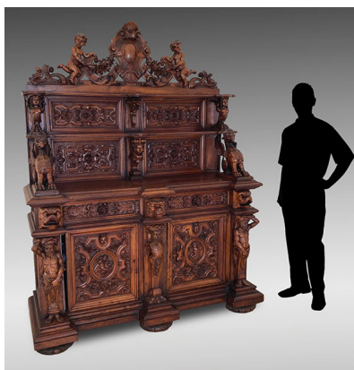
1102) Massive Carved Walnut Step Back Hunt Board / Cabinet with mountain man and winged gryphon carvings approx. 92.5" h x 72" w x 26.5"