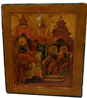
1016) Exceptional Russian Icon