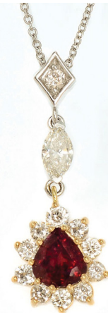
1124) 18K Ruby & Diamond Pendant & Platinum Cable Chain