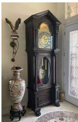
Muller Chime Grandfather Clock