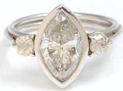
1003) 2.87 CT MARQUISE BRILLIANT DIAMOND RING: 14K white gold featuring a bezel set Solitaire Marquise Brilliant Diamond approx. 2.87 Ct, rated 11 in clarity and G in color. Flanked by two old mine cut diamonds, approx. .40 Ct. The diamonds average SV in clarity and I-J color. These diamonds are prong set. Size 6. Weight 5.2 grams. GIA Graduate appraised at $17,500 dated 5/25/10.

Note: Contact mail@burchardgalleries.com to join our mail list to receive our color pdf brochures.