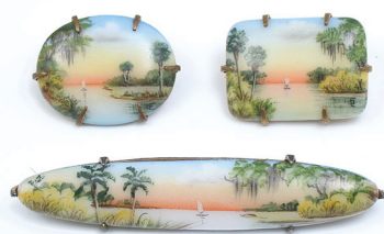
1021) Beautifully detailed Olive Commons Jewelry & Porcelain lot