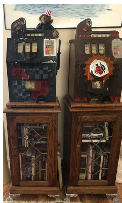
5 & 25 Cent Mills Slot Machines on Stands