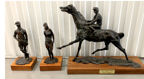
1008) Leroy Neiman Bronze Horse Racing Suite