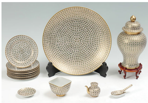
1331) 17 pc. mid 20th c. Japanese Kutani "Thousand Flower" Porcelain

Estate Antiques Fine Art Jewelry Auction Sunday August 16th, 2020 12 PM St Petersburg, FL