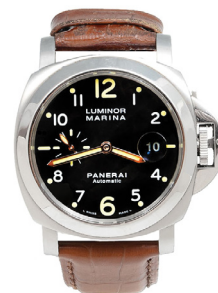
1105) Stainless Panerai Luminor Marina Watch with Leather Strap: All original box, papers, booklets, and tags with warranty card dated 25/4/12.