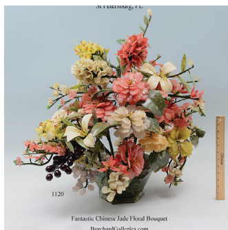
1120) Fantastic Chinese Jade Carved Floral Bouquet