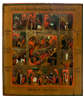
1015) Exceptional Russian Icon