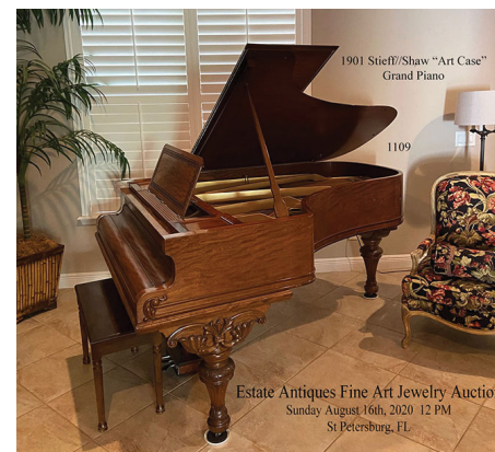
1109) 1901 Steiff/Shaw 67, Grand piano. One-of-a-kind "Art Case", Serial #13675