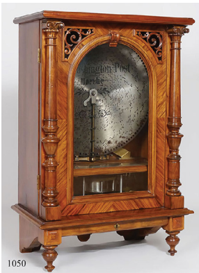
1050) Coin Operated Polyphon Disc Playing Music Box: Double comb, plays 20" discs. Mahogany case with single glass front doors, carved and pierced decoration, turned front legs. Case measures 36 1/2" x 23 1/2" x 13 3/4" overall. Sold with complimenting Jacobean Style Carved Oak Cabinet Stand and approximately 43 discs.