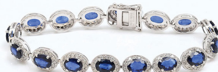
1151) 14K Diamond & Sapphire Bracelet by Orianne