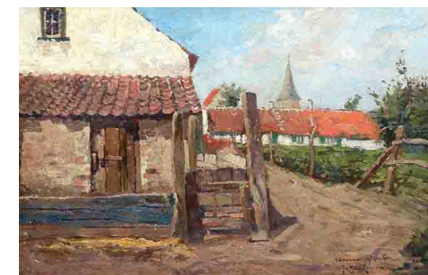
1101) JULES MARCKAERT Village Street Scene