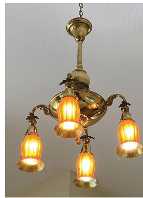
1047) Brass Chandelier w/ Quezal Shades. 1 of 2