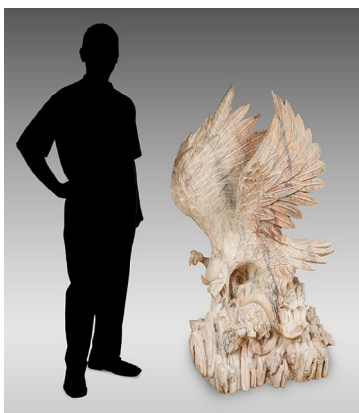
1075) Massive Asian Carved Marble Eagle with Snake in Talons. Some condition issues but still a Showstopper! 57" h