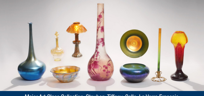
Major Art Glass Collection: Steuben, Tiffany, Galle, La Verre Français